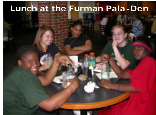
Lunch at the Furman Pala-Den

Focused academic preparation for high school concentrating on math and literacy skills taught by high school teachers.