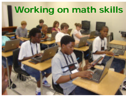
Working on math skills

Focused academic preparation for high school concentrating on math and literacy skills taught by high school teachers.