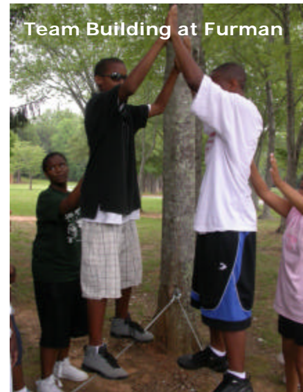
Team Building at Furman